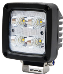
QWL40 / QWL40-DT