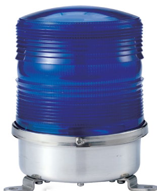
S150RL-FT / S150RS-FT