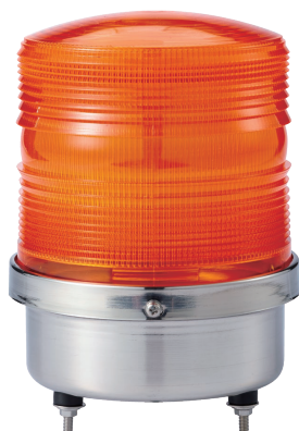
S150RL / S150RS