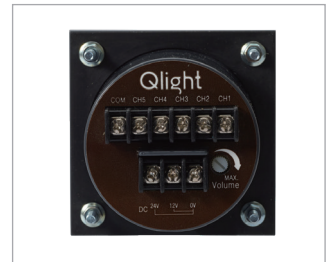
Terminal block for power only (back side, SPK-N)