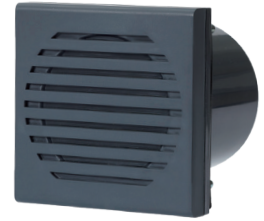
SPK I SPK-N