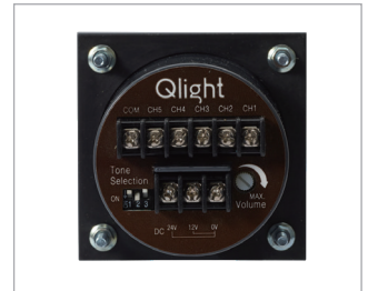
Terminal block for power and sound (back side, SPK)