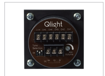
Terminal box for Power and sound (back side)

※ Max.built-in volume feature is based on WS-Ch1 / WM-Ch4 / WA-Ch4.