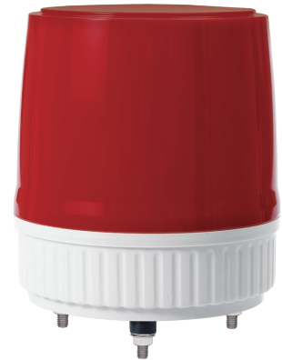
S180US / S180UHS