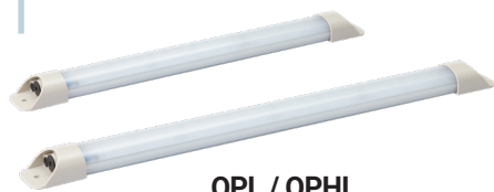
QPL / QPHL Translucent lens

Waterproof LED light bars, suitable for dusty and moisture environments