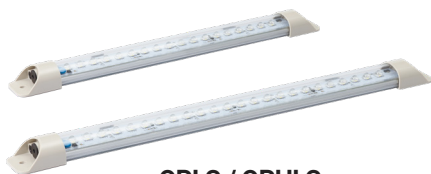
QPLC / QPHLC Transparent lens