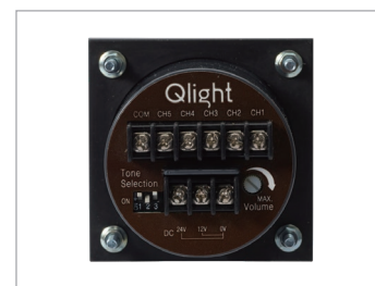
Terminal box for Power and sound (back side)

※ Max.built-in volume feature is based on WS-Ch1 / WM-Ch4 / WA-Ch4.